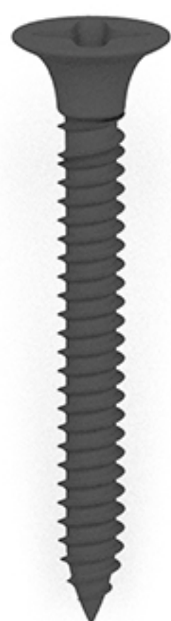
Screw x 2