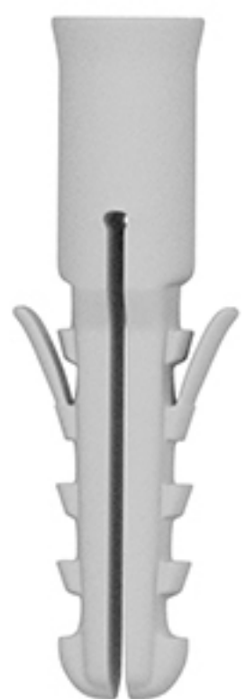
Wall Plug x 2