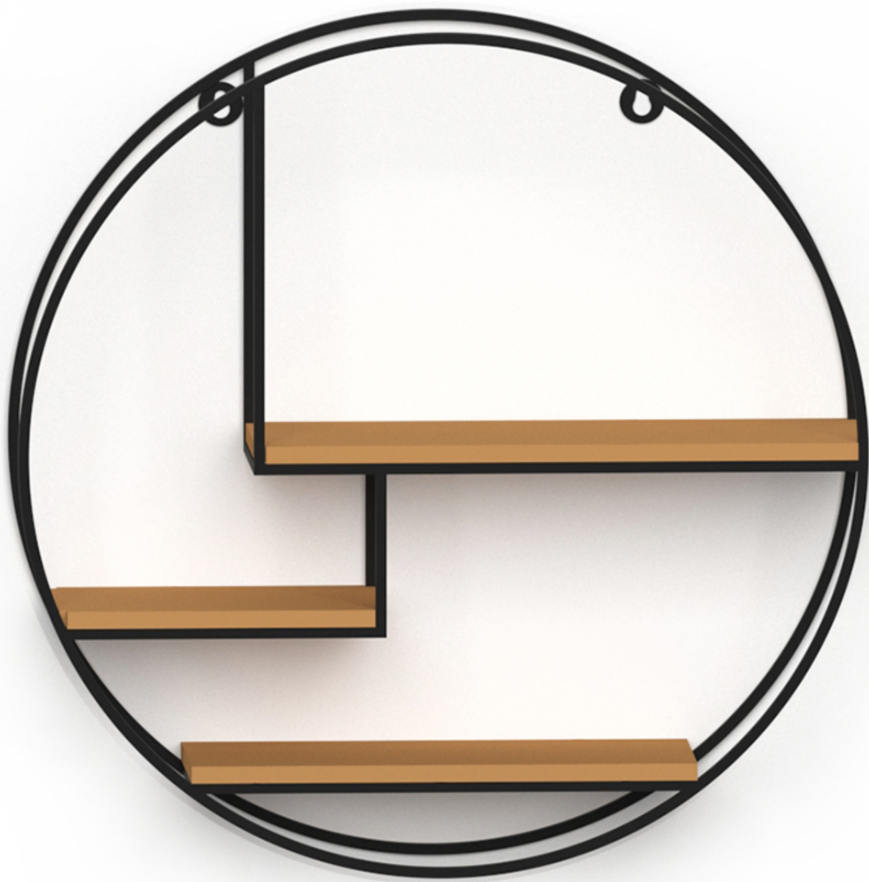
Shelf x 1